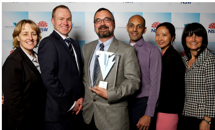
Some members of the team.